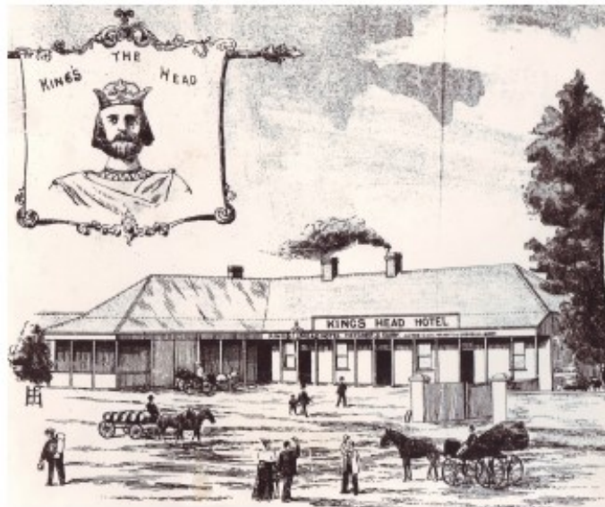
A line drawing of the Kings Head Hotel Circa.1892