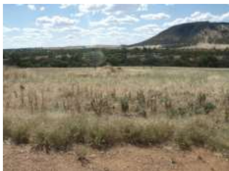
Non-Compliant Hazard Reduction

2.1m firebreak around every 300ha block and all building, fuel, haystacks and drums.