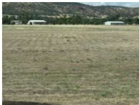
Compliant Hazard Reduction