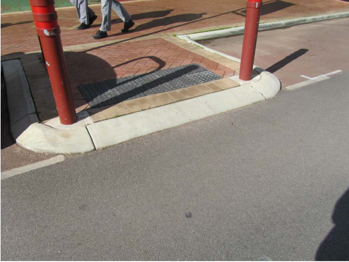
Kerbing at this crossing is too steep. When crossing here users roll onto road before getting a chance to see if a car is coming.