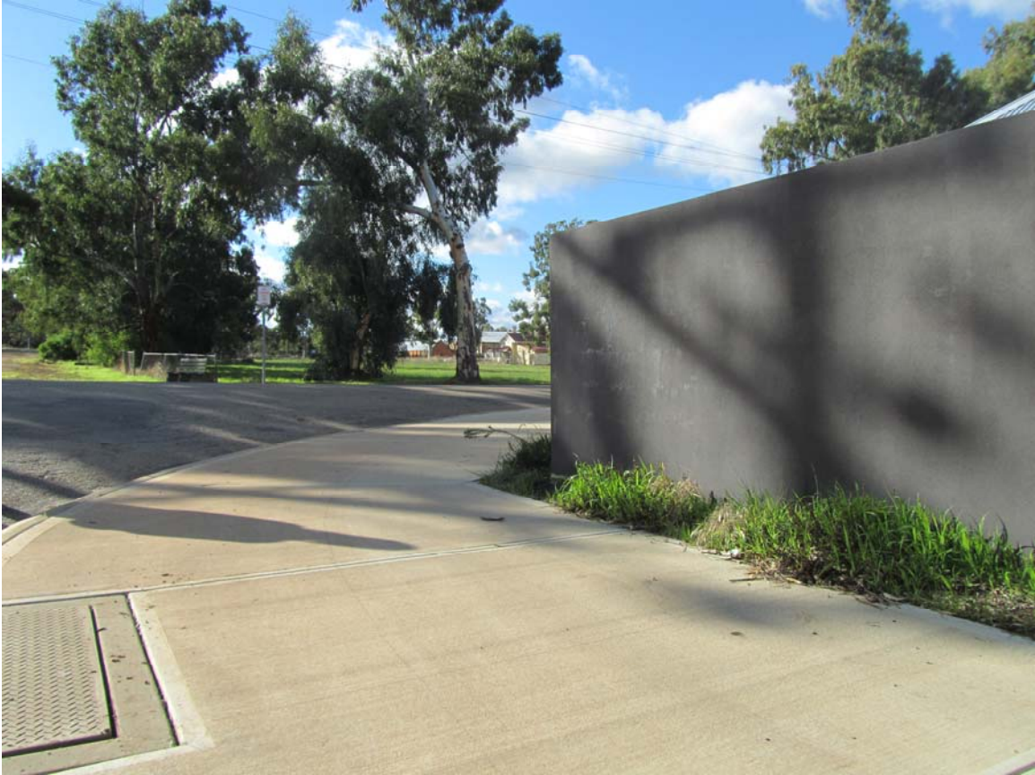
When crossing Howick Street users cross the road and hope for the best. Can not see if cars are coming at all.