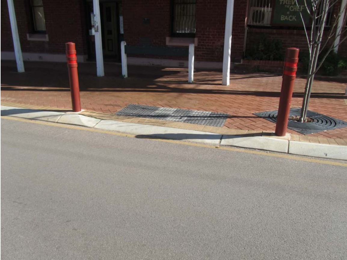
This is an example of what the crossings should look like.