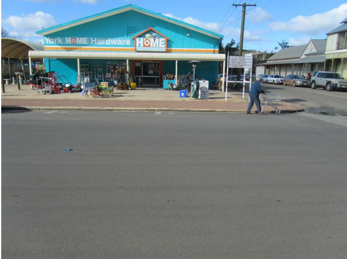
No ramp has been installed.