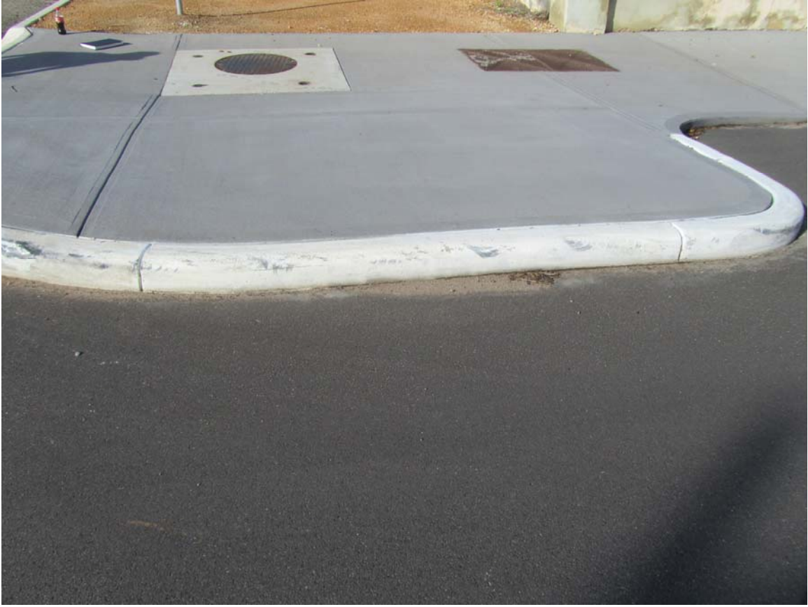
Nice nib no ramp.