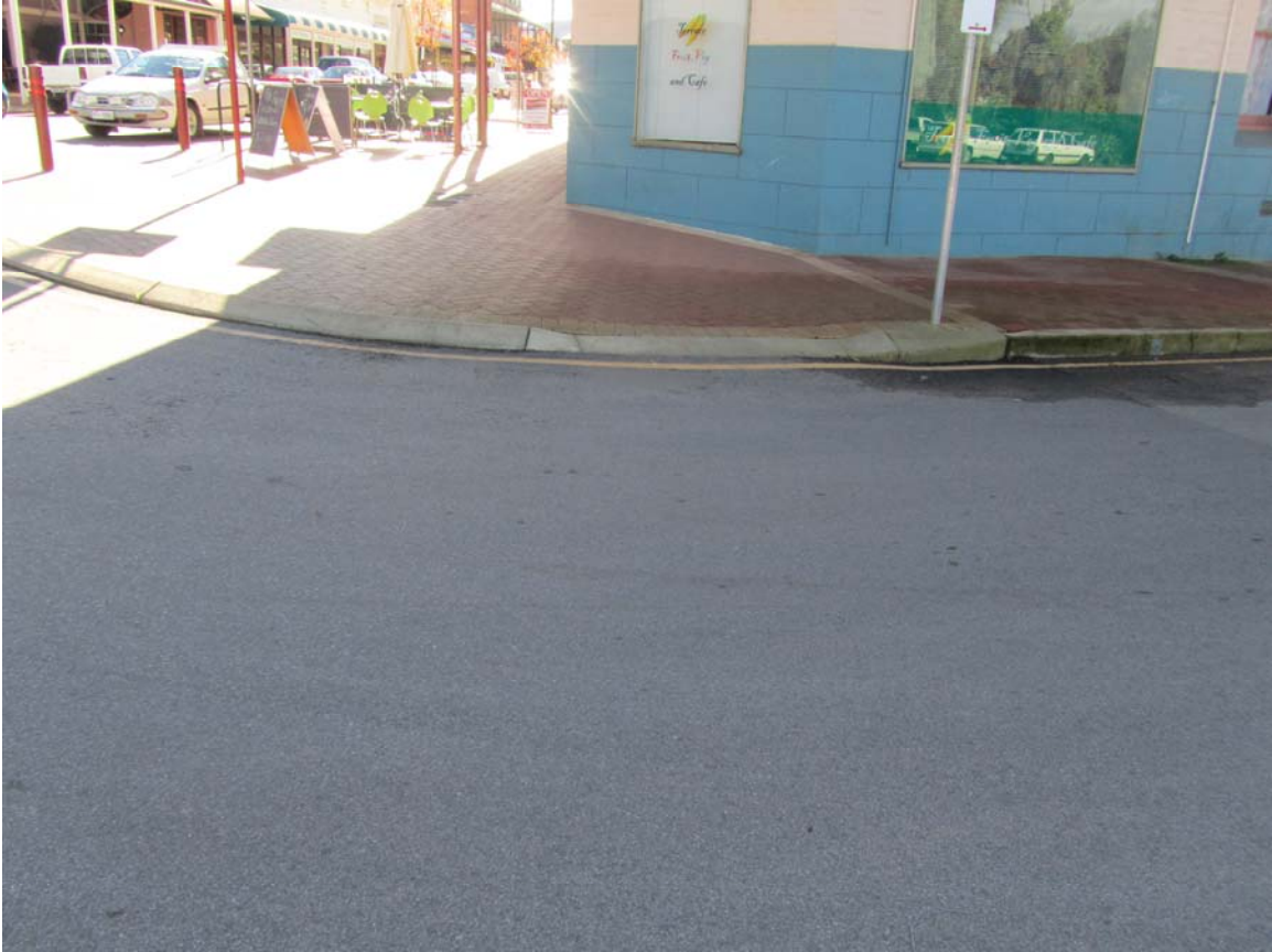
The ramp is in the wrong position and does not line up with the ramp that is needed on the other side of the road.