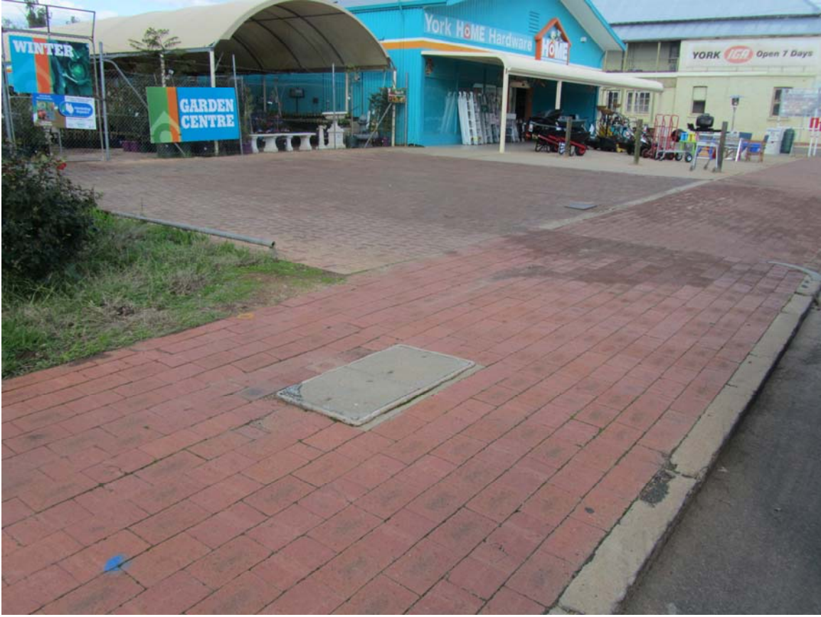
This cover is above the footpath approx 40mm.