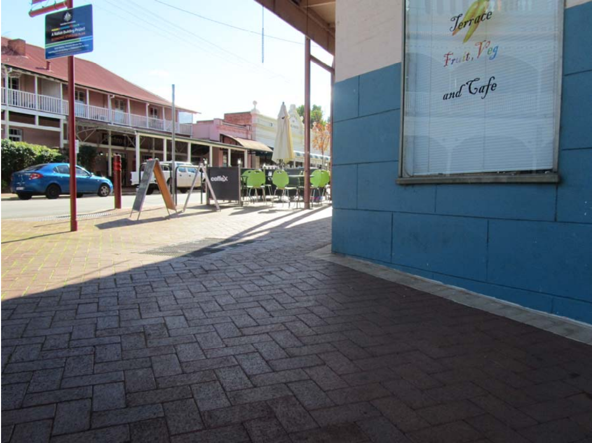
This is the view of the ramp when in the position of a person in a wheelchair. It is very difficult to see if cars are going to turn.