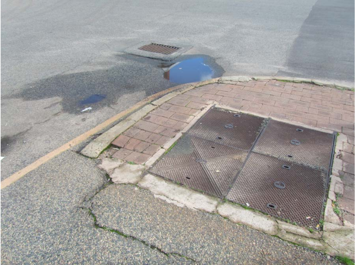
Footpath uneven and needs fixing.