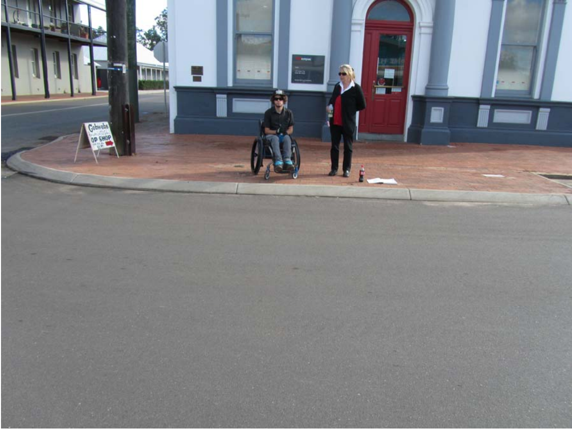
Nice big nib but no proper ramp. Kerbing too steep.