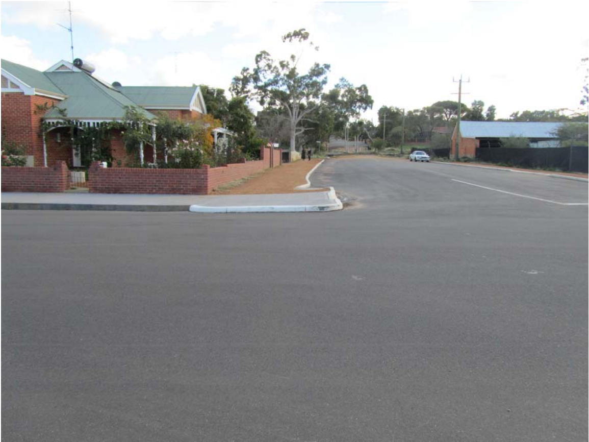
No footpath to WIFSA and problems with flooding.