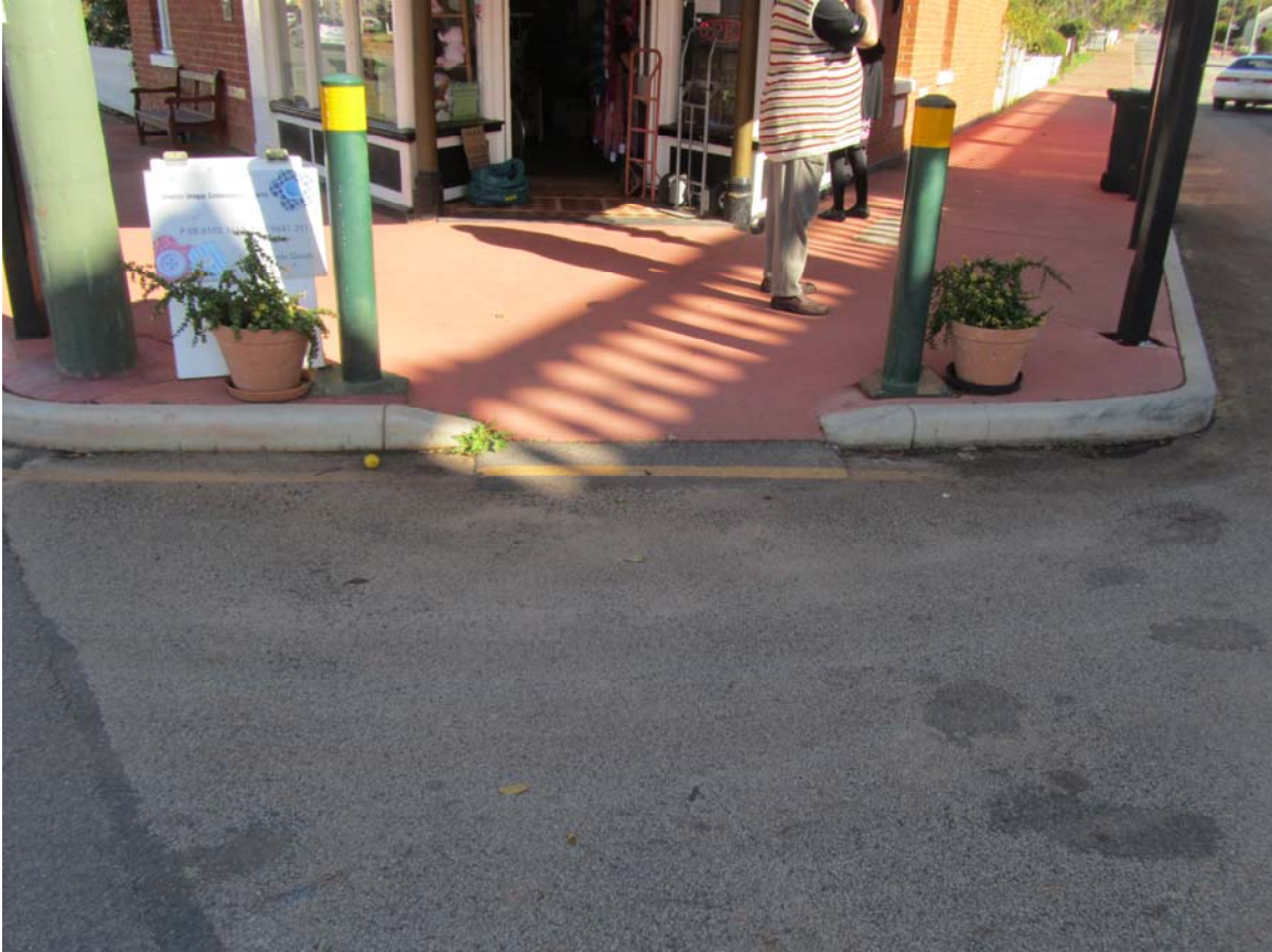
This ramp is sloped well and is in a position that users can see approaching cars.