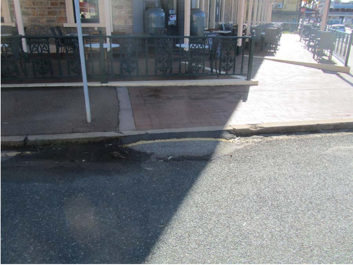
This ramp outside the Imperial does not line up with the ramp outside the Town Hall and is approx 6 meters from Avon Terrace. It is also of poor design and non compliant.