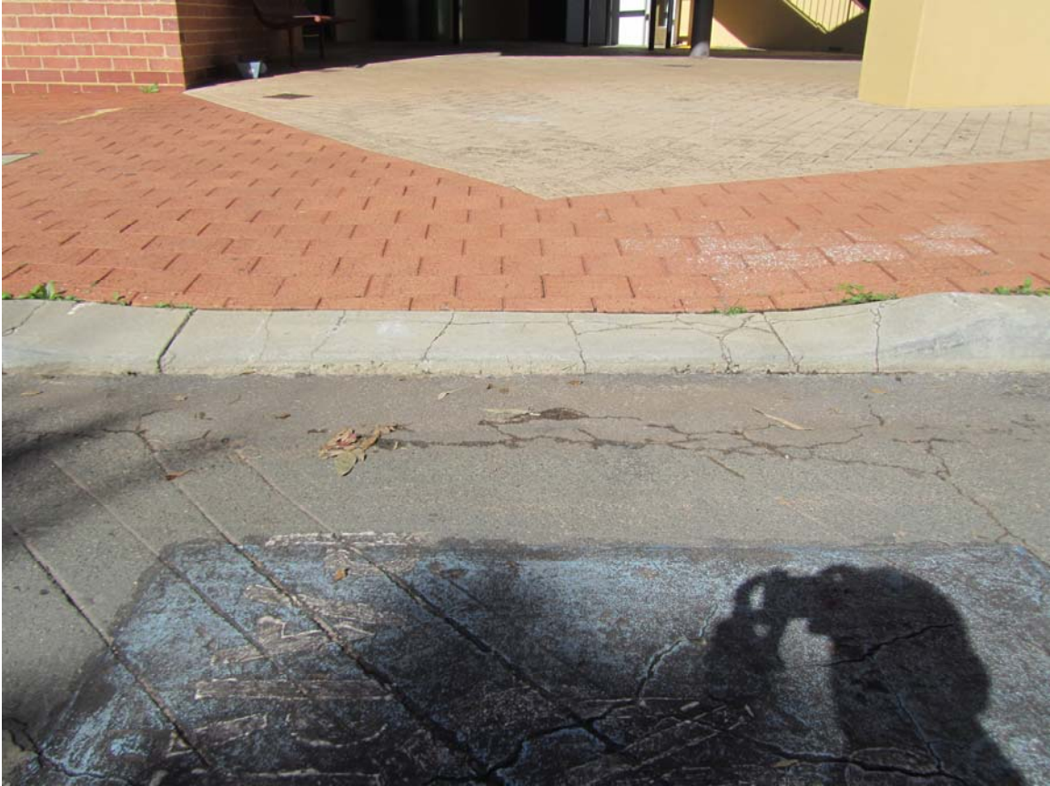
The ramps outside the shire office have a lip of approx 50mm and the rear anti roll wheels on a wheelchair get stuck on a lip of this height.