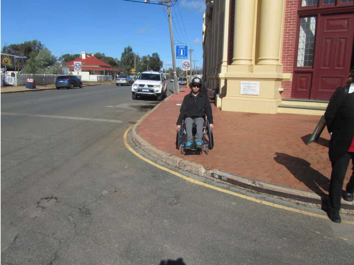
This is where the ramp needs to be situated so a person crossing the road can see oncoming traffic.