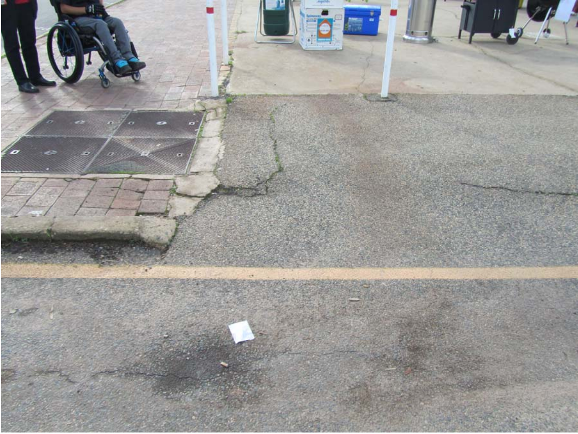
No proper ramp to cross from hardware to IGA. This sloped area does not line up with Ramp at IGA.