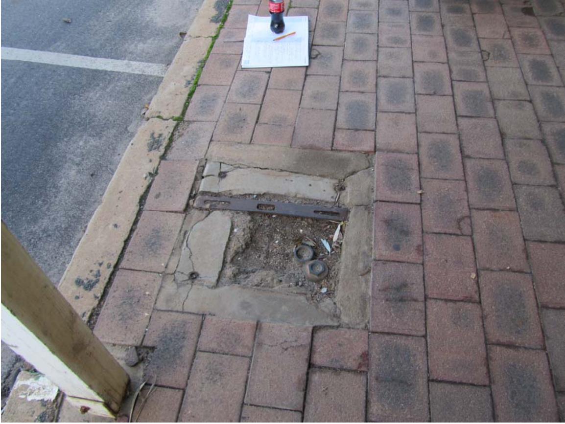
North of old fire station has pipes and holes in the paving.