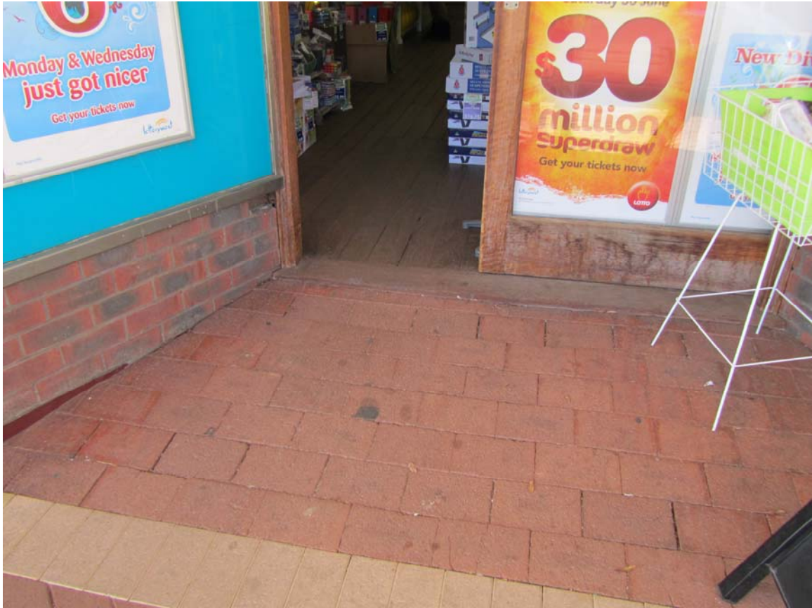
Many of the shop fronts in York are difficult for those in wheelchairs to gain access.