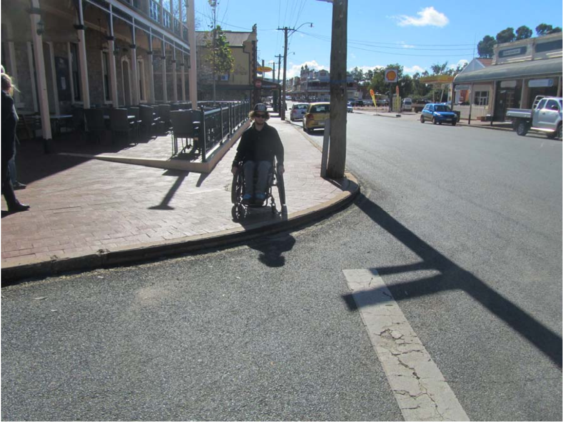
This is where the ramp should be located as to line up with the correct position of the ramp outside the Town Hall.