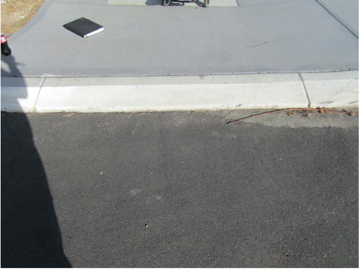
Lip on ramp here approx 40mm