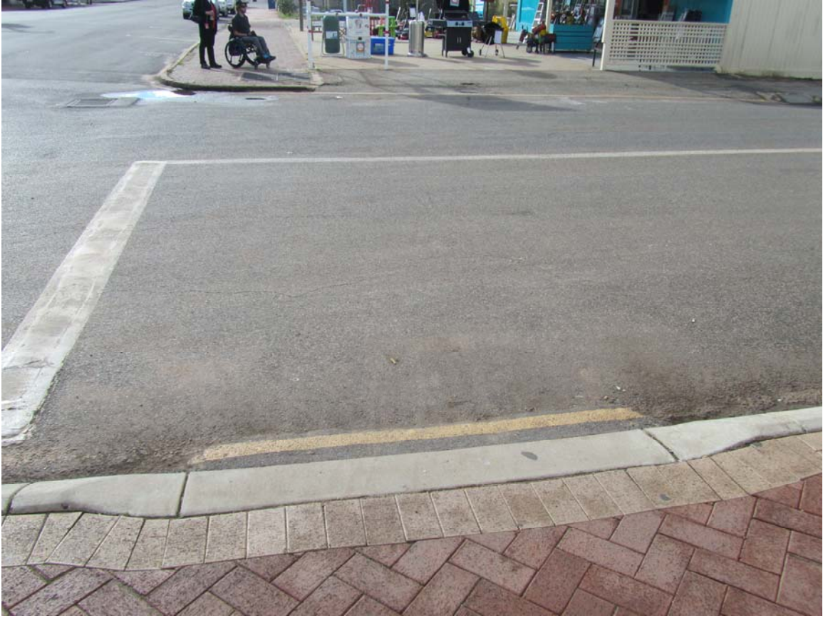
This ramp is okay.