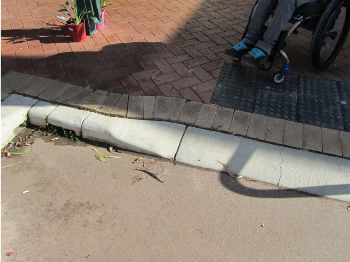
Same problem here as across the road and approx 8 pavers need to be pulled up and re-laid due to the large lip.