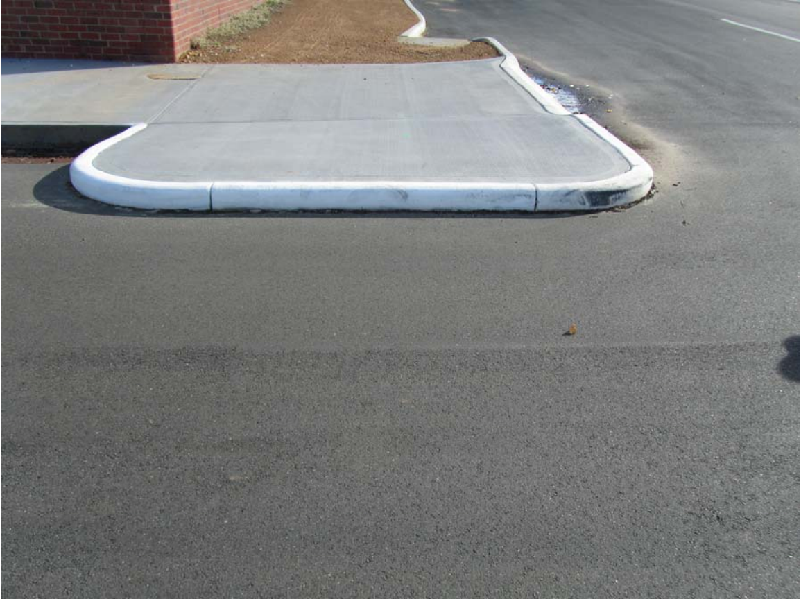
Nice nib no ramp.