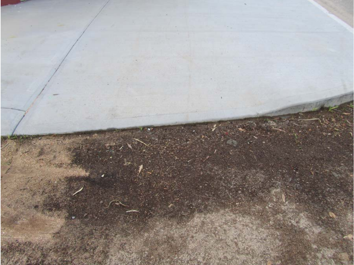
Large lip both sides of Harvey Street between Dolzy shop and old Bank of Australia.