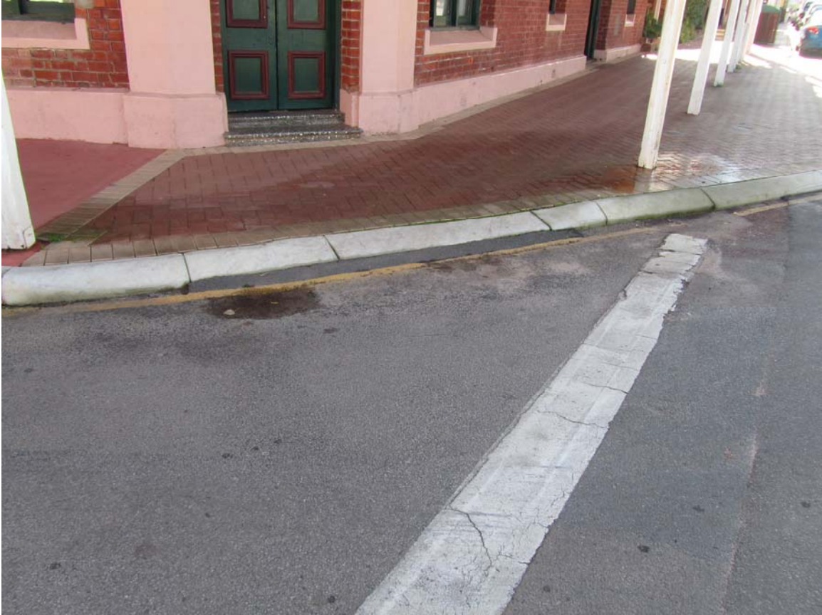
This ramp is on such an angle that users tend to roll when using this ramp.