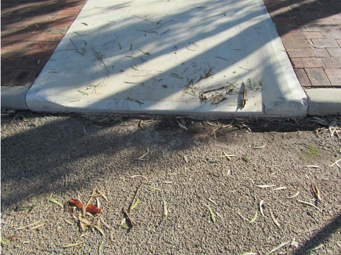
Lip this side of Howick Street is approx 80mm. Also unable to be used by a person in a wheelchair.