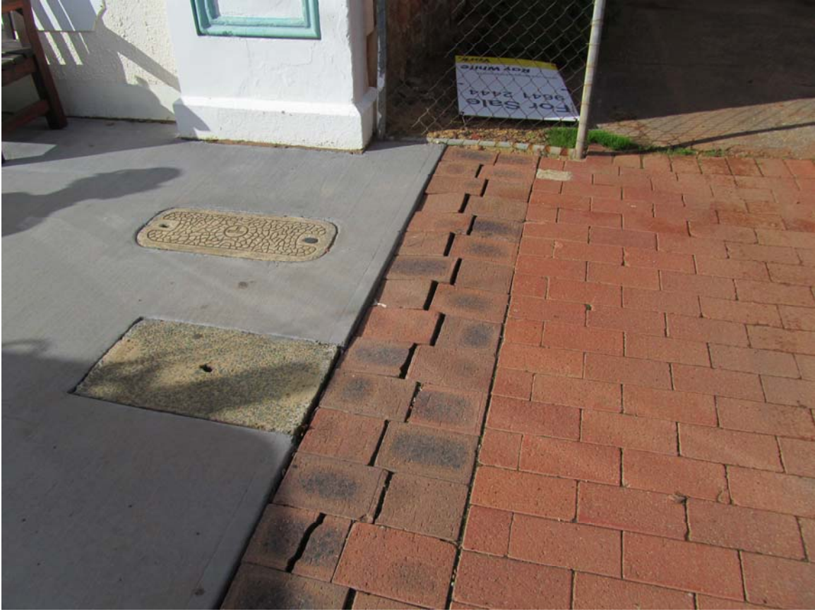
Paving north of vet before joining concrete footpath is loose and uneven.