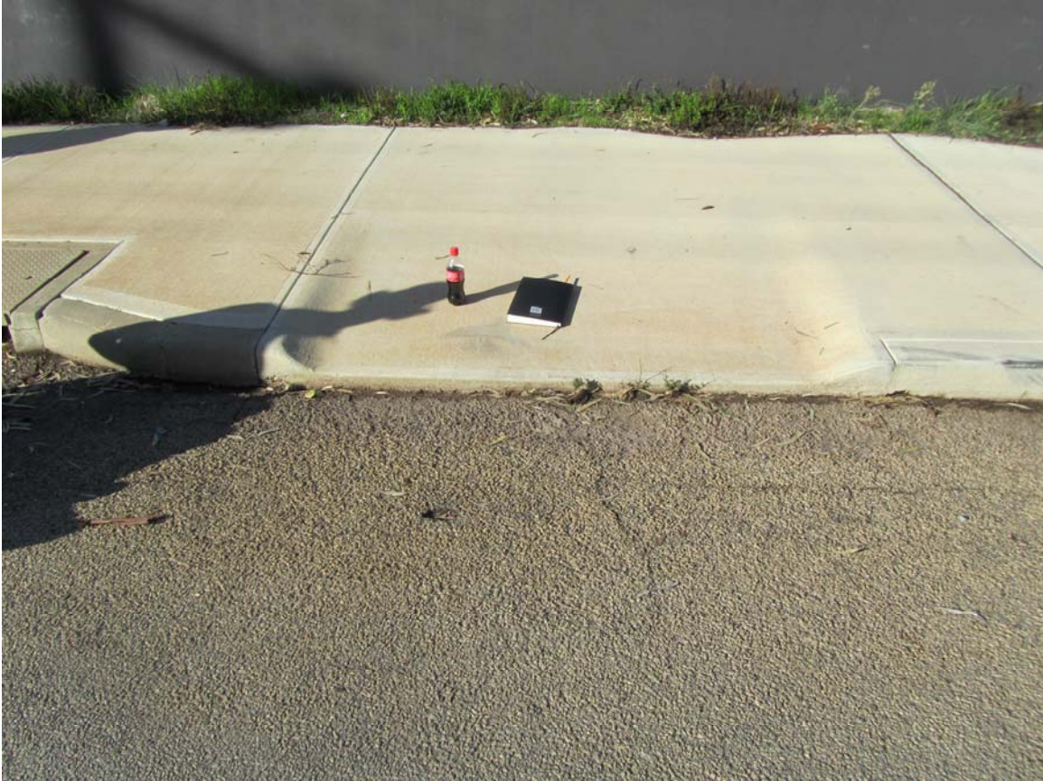
Lip here is approx 70mm. Unable to be used in a wheelchair.