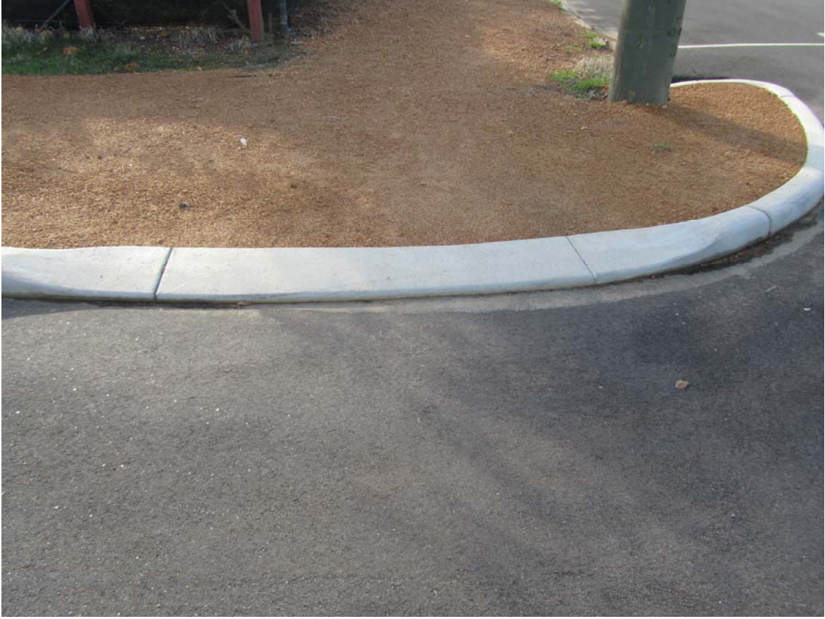
Large lip 40mm.